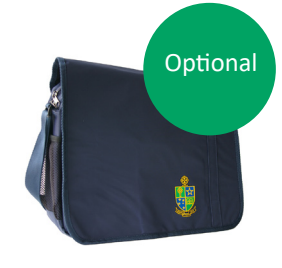
Excursion Bag Yr9-12