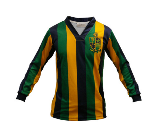
AFL Jersey Long Sleeve