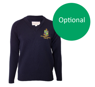
Pullover Year 12

For current prices, please refer to www.bobstewart.com.au