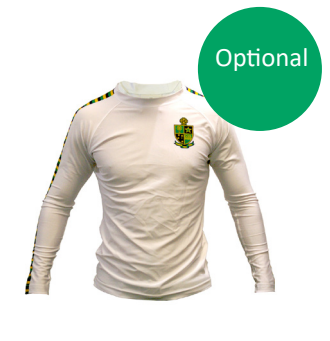
T Shirt Long Sleeve