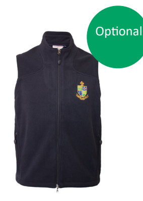
Polar Fleece Vest