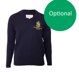
Pullover Year 12