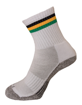
Sports Sock 2pk